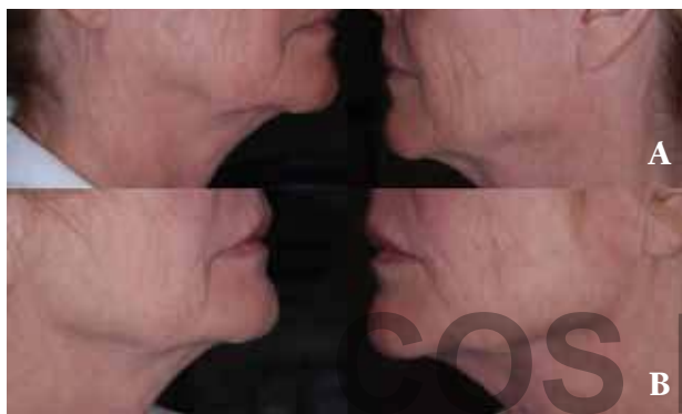
Figure 2. A 65-year-old patient before (A) and one month posttreatment with the Accent XL radiofrequency device (B). An independent physician-evaluator noted a 45% clinical improvement.