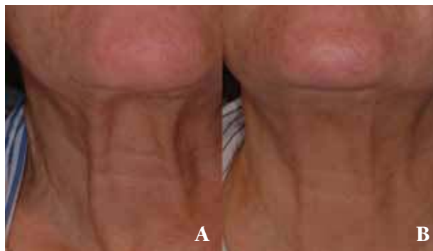
Figure 3. A 70-year-old patient before (A) and one month posttreatment with the Accent XL radiofrequency device (B). An independent physician-evaluator noted a 55% clinical improvement.