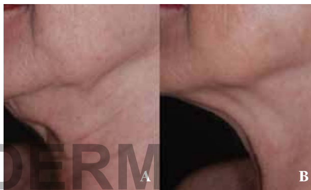
Figure 4. A 64-year-old patient before (A) and one month posttreatment with the Accent XL radiofrequency device (B). An independent physician-evaluator noted a 65% clinical improvement.

applied to the handpiece, keeping it in direct contact with the skin. Care was taken to avoid the thyroid gland. The skin temperature was monitored using an infrared surface thermometer. Once the desired skin temperature of 40°C was achieved, the fluence was decreased to 95 W. Treatment continued until 110 kJ was delivered to the face and neck with the unipolar handpiece.