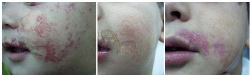
Fig. 2 A 2-year-old girl at time of CO 2 treatment; facial scar induced by hemangioma. Original hemangioma, scar before and 3 months after one treatment, parameters: 25 W and 200 ms pulsed duration

The present study reports the outcome of 24 children with facial scars treated with ablative fractional CO 2 laser photothermolysis. Although confluent ablative resurfacing with the CO 2 or Er:YAG laser remains the gold standard in skin rejuvenation, it is associated with considerable downtime and a risk of prolonged erythema, infection, scarring, and delayed hypopigmentation [8–11]. Moreover, it is painful and usually requires general anesthesia. In the search for alternatives that would also promote some collagen regrowth, researchers first turned to nonablative and intense pulsed light lasers [12, 13]. These were found to be safe but limited in efficacy, and the results were not comparable to ablative resurfacing.