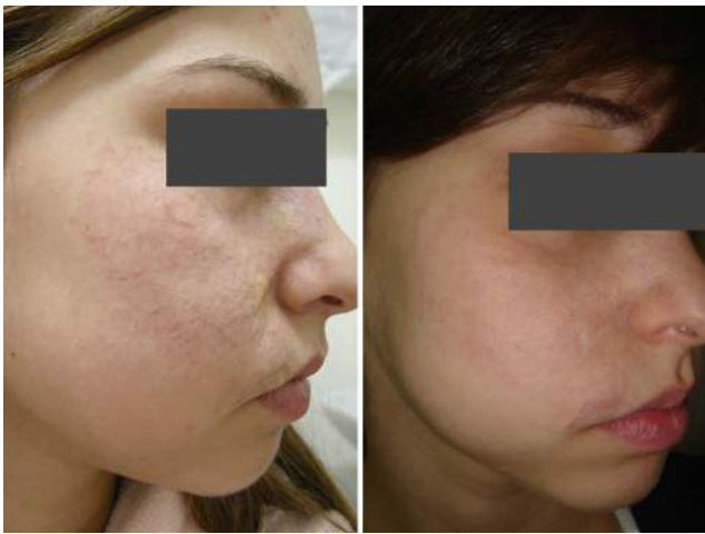
Fig. 1 A 15-year-old girl; facial scar induced by hemangioma. Before and 6 months after two treatments, parameters 25 W and 200 ms pulsed duration

cutaneous leishmaniasis, 1 was incurred during a terrorist attack, and 1 was the residua of pyoderma gangrenosum. All of the scars were mature and stable. None of the patients had undergone prior skin resurfacing. Exclusion criteria were photosensitivity, use of photosensitizing drugs, history of scarring after vaccinations, or active skin disease in the treatment area. Patients' parents were provided with a detailed description of the purpose and possible outcomes of treatment and signed informed consent forms.